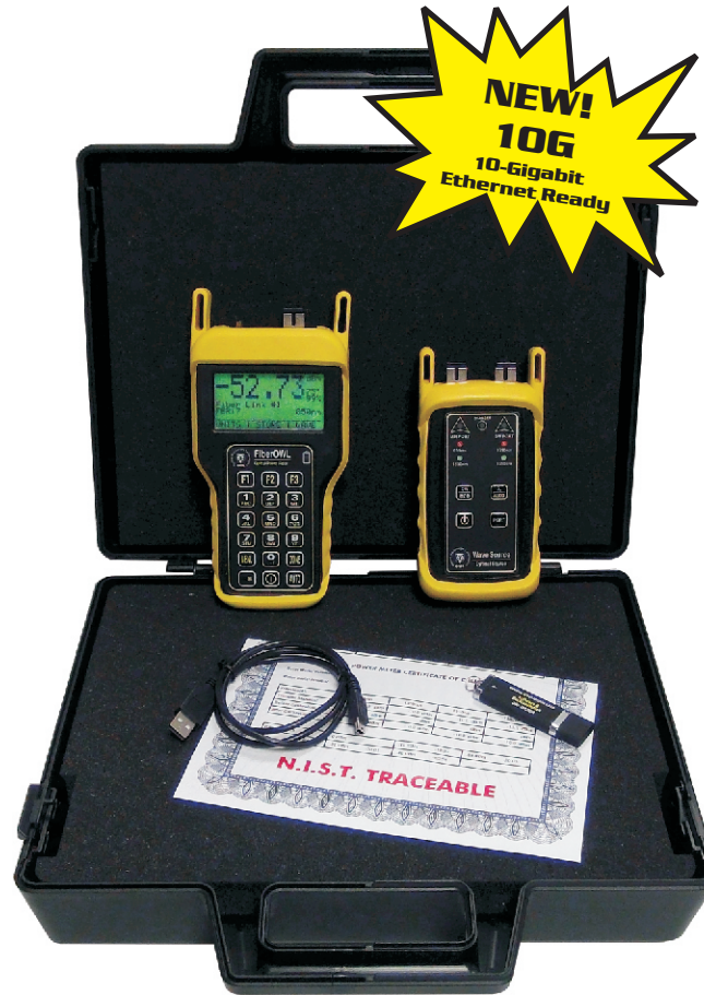
Connector styles or placement may vary from photo

Three connector options are available (ST, SC, and FC), and is upgradeable to include 850 & 1300nm multimode sources.