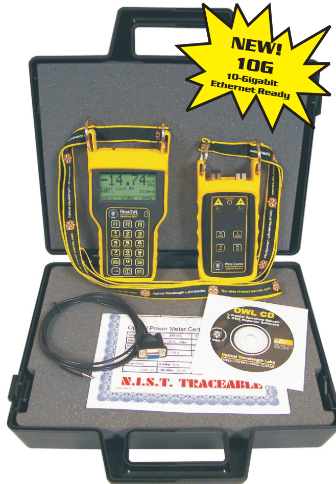
Connector styles or placement may vary from photo