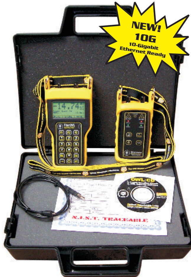
Connector styles or placement may vary from photo

Also supports 2 user-definable standards