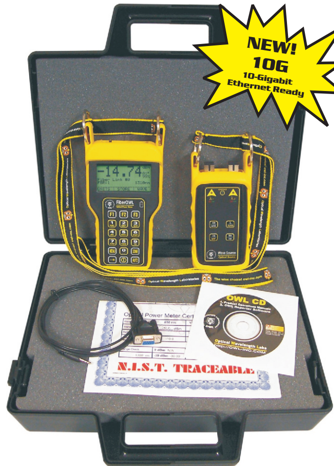
Connector styles or placement may vary from photo