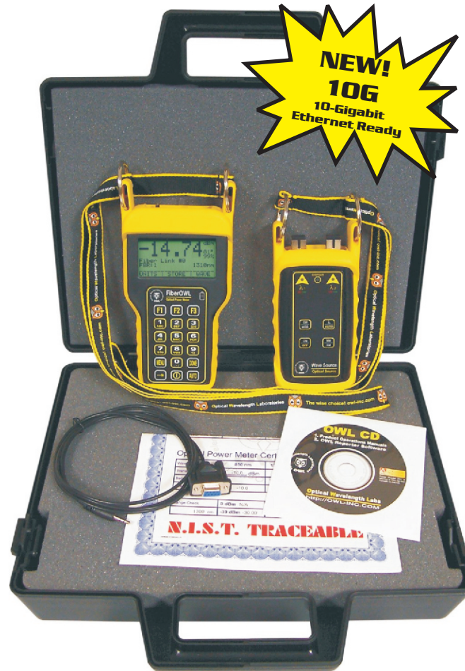
Connector styles or placement may vary from photo

Three connector options are available (ST, SC, and FC), and is upgradeable to include 1310 & 1550nm singlemode sources.