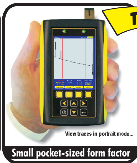
View traces in portrait mode...