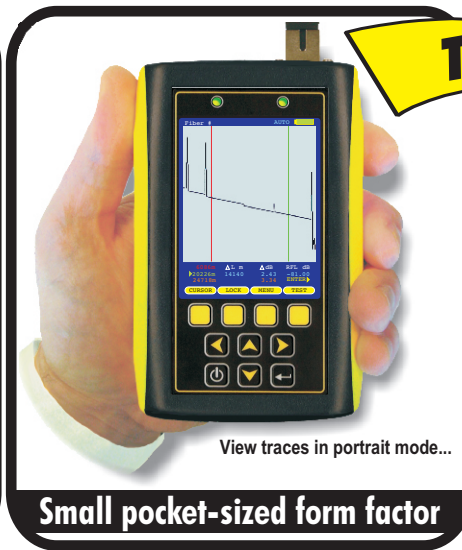
View traces in portrait mode...