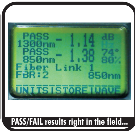
PASS/FAIL results right in the field...