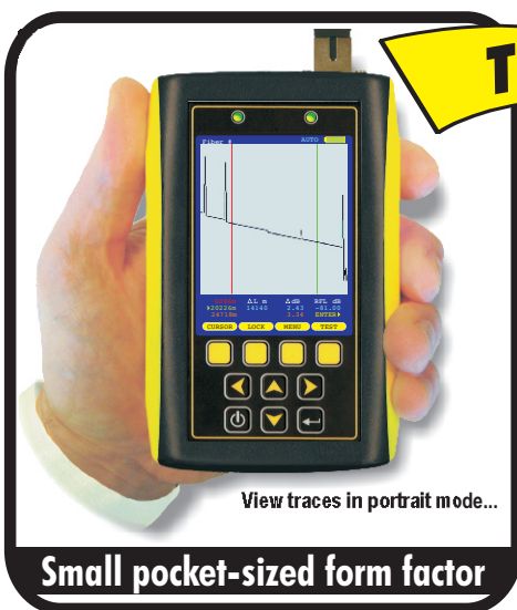
View traces in portrait mode...