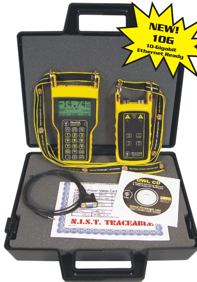
Connector styles or placement may vary from photo