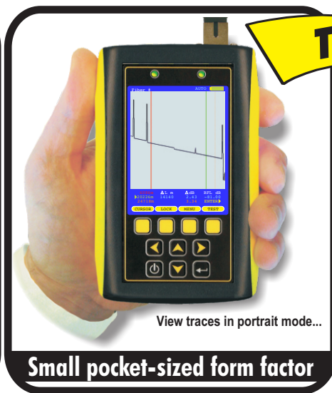
View traces in portrait mode...