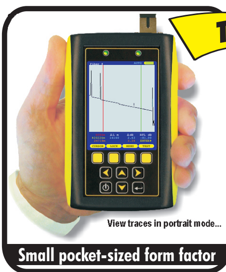
View traces in portrait mode...