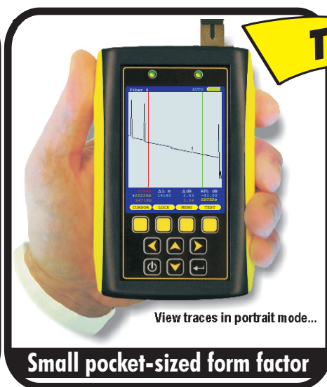
View traces in portrait mode...